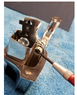
Pic 3 - roll pin

Step 4 - Remove factory roll pin from factory door handle (Pic 3) in order remove lever.