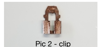
Pic 2 - clip

Step 3 - Remove exterior door handle clip and rod in order to remove handle