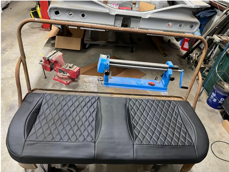
Insert bottom foam insert into frame